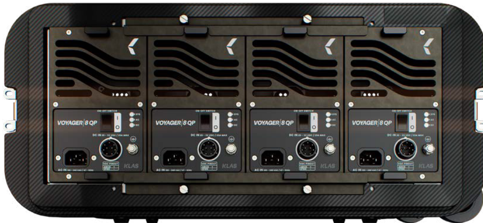
Voyager 8 QP Rear